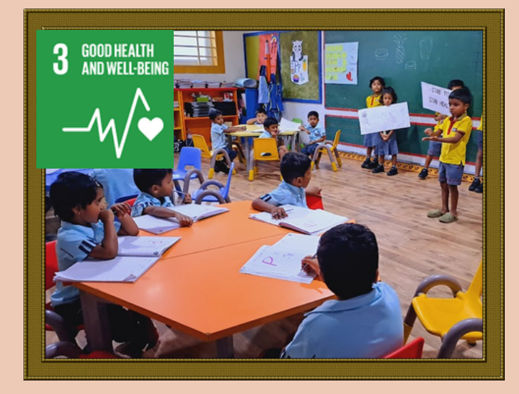
Going for a campaign

"Investing in children and young people to achieve a more equitable, just, and sustainable world for all. Children are at the heart of the concept of sustainability"