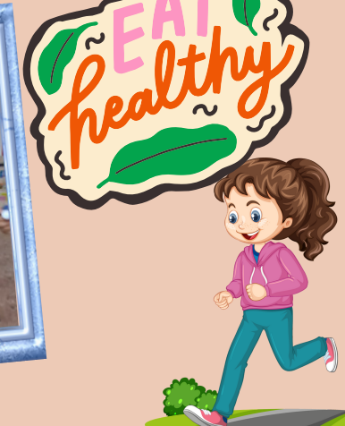
Discuss & Reflect